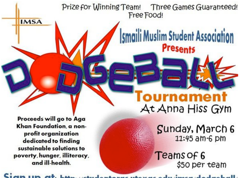
Sign up at: http://studentorgs.utexas.edu/imsa/dodgeball/

Students for Clean Water has a goal is to raise $40,000 to build wells for schools in Ethiopia to give them clean water for the first time. We have an amazing opportunity by being able to pair up with Google! For the next two weeks, anyone who signs up through our website at <a href="www.studentsforcleanwater.org/hotpot">www.studentsforcleanwater.org/hotpot</a> and registers with Google's new product "Hotpot" can do ratings and reviews of almost anything- for every rating/review done SFCW gets a dollar! I've attached some more information and visuals. Thanks so much for advertising for us!